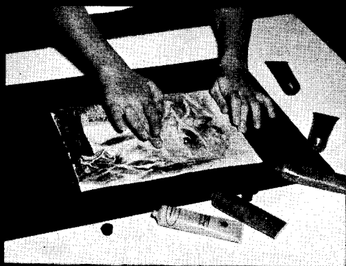
Finger being used for finer work

It is fun to make paintings and then use them to decorate different items, such as waste paper baskets, boxes, lamp shades, etc. Cut the painting to fit the object and glue in place. The different photographic illustrations show some of the many strokes used in FINGER PAINTING.