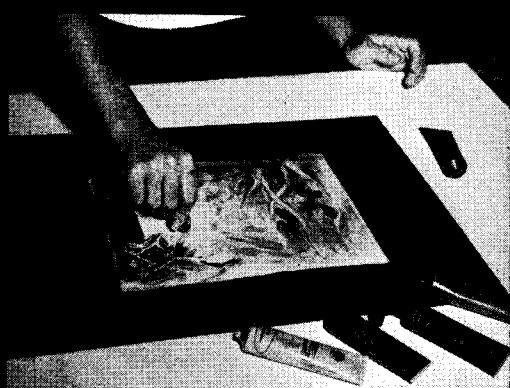
Finger nails are used for detail