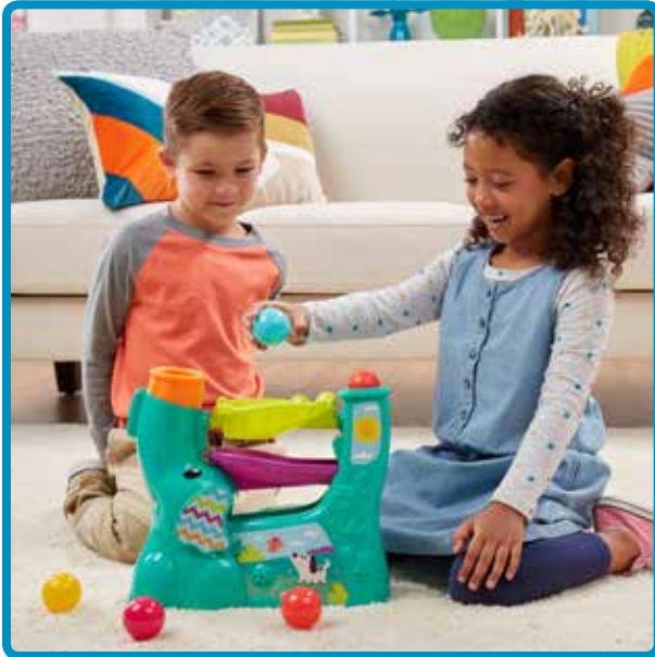
It's a friend's turn to put a ball in the ball catcher.