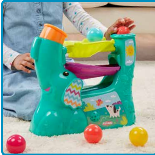
Watch it go down the track!