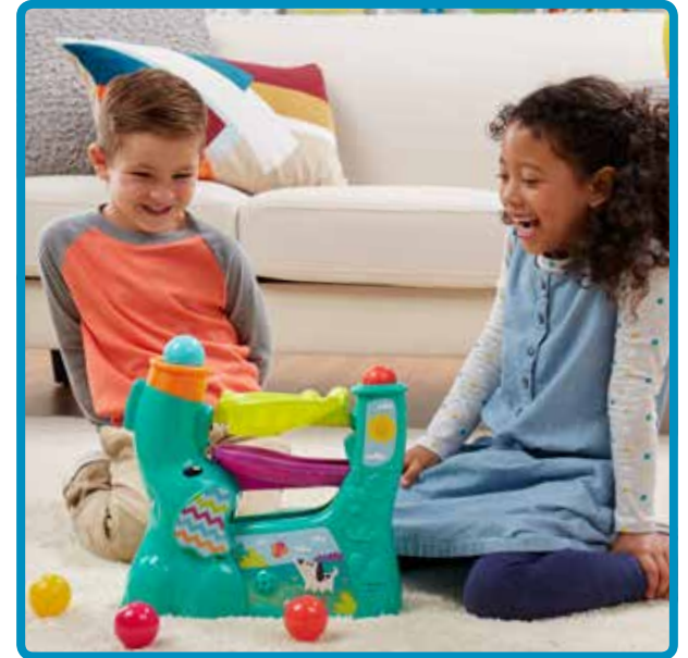
Watch the ball pop out of the trunk!