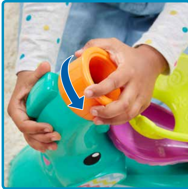
Turn this to make the balls pop out in different directions.