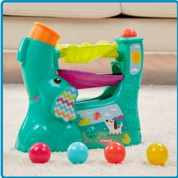
This is the Playskool Chase 'n Go Ball Popper.