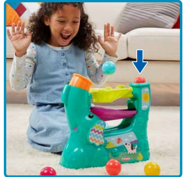
Press this button to turn on the music and make the balls pop out of the trunk.