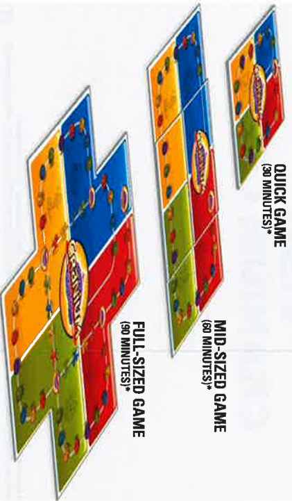
QUICK GAME (30 MINUTES)*

Fold the board to pick the game length you want.