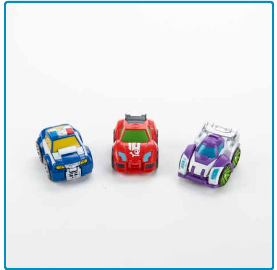
Chase the Police-Bot™