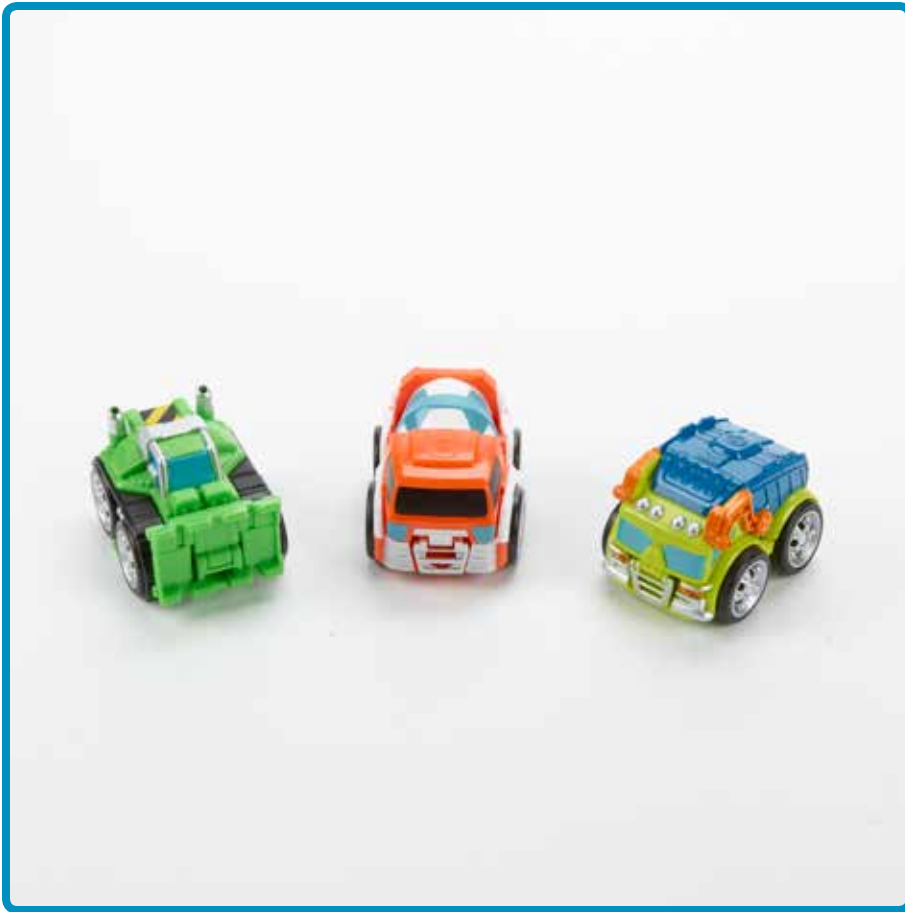
Boulder the Construction-Bot™