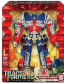
TRANSFORMERS Leader Class