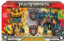
TRANSFORMERS NEST Battle Pack