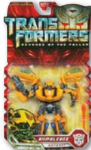
TRANSFORMERS Deluxe Class