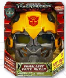
TRANSFORMERS Bumblebee Helmet

Step #2: Print out this order form and fill it out completely. Use a separate order form if you qualify for more than one 3-figure set.