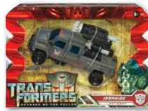
TRANSFORMERS Voyager Class