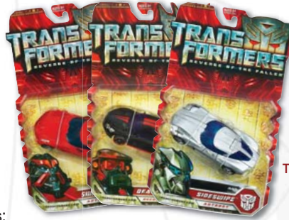
Three Free TRANSFORMERS Deluxe Class Figures

Instructions for receiving your three free TRANSFORMERS Deluxe Class Figures: