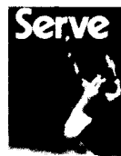
1 Serve Deck