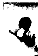
1 Play Deck