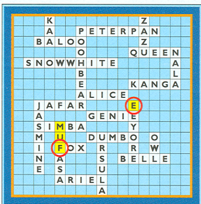
Example 2B: ... but decides to start EYORE by covering the E, and continue MUFASA by covering the F.