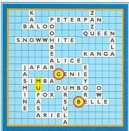
Example 2A: The second player could start GENIE and BELLE by covering the first letter in each word...