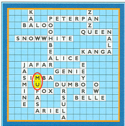
Example 1B: ...but decides to cover both the M and the U in MUFASA, instead.