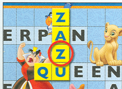
Example 5: If the Z and A in ZASU are covered, and the U in QUEEN is already covered, complete ZASU by covering the second Z – then collect a scoring chip.

© Disney. Based on the "Winnie the Pooh" works © A.A. Milne and E.H. Shepard.