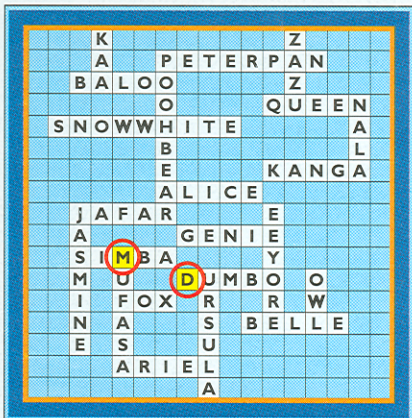
Example 1A: The first player could start MUFASA and DUMBO by covering the first letter in each word...