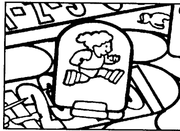
ASSEMBLED GAME PIECE